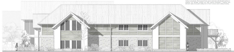
Elevation E - Hotel Side Elevation