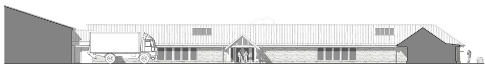
Elevation G - Staff Building Court Yard Elevation