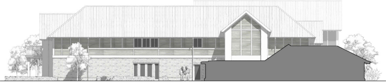
Elevation F - Hotel Side Elevation