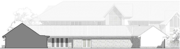
Elevation J - Staff Building Court Yard Elevation

© Wildblood Macdonald Architects. All rights reserved. No part of this document may be reproduced, stored in a retrieval system, or transmitted in any form or by any means, electronic, mechanical, photocopying, recording, or by any information storage and retrieval system, without the prior written permission of Wildblood Macdonald Architects.