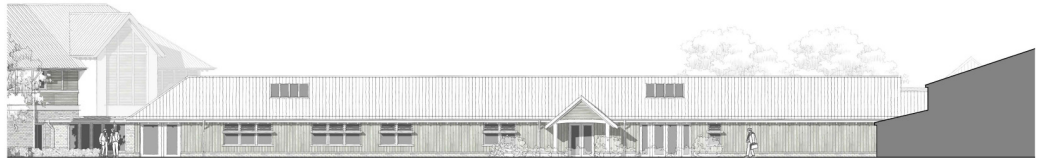
Elevation H - Staff Building Rear Elevation

wildblood macdonald Parkhill Studio, Parkhill, Wetherby Road Wetherby, LS12 3JZ 01937 542500 | 01937 542501 www.wildblood-macdonald.com