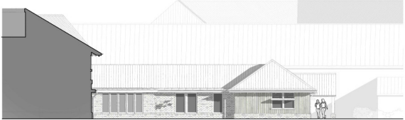
Elevation K - Staff Building Court Yard Elevation